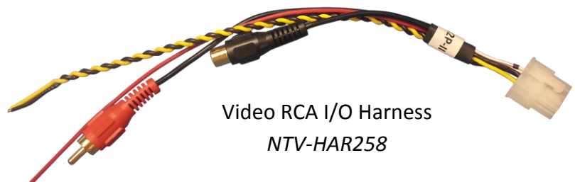
Video RCA I/O Harness NTV-HAR258