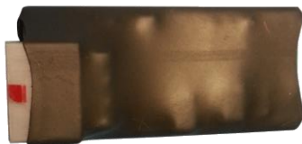
V2P Board NTV-ASY177