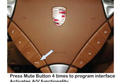
Activates A/V functionality

Programming Interface: Press the steering wheel Mute button 4 times to activate the A/V functions of the interface. The radio will display Service and then the radio will reboot. After the reboot is completed the A/V interface will be functional.