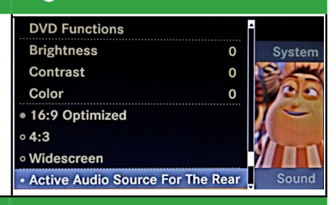
To Activate Video in motion (GL, ML, R Class)