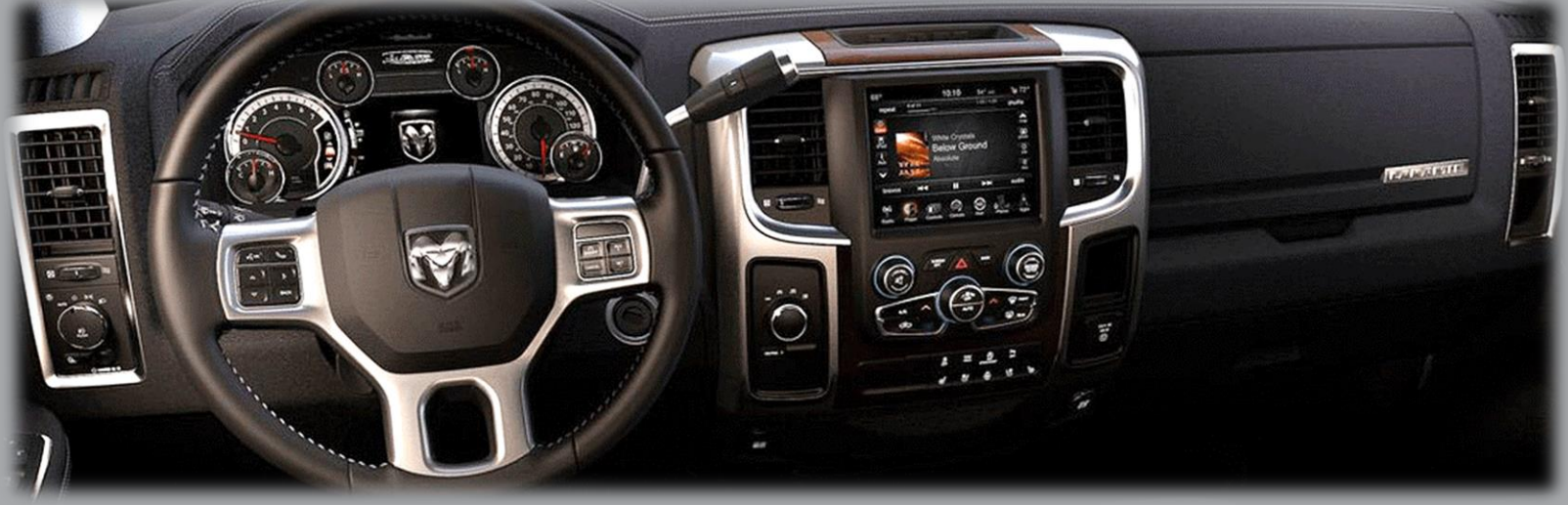
Compatible with select 8.4" & 5" uConnect radios

Chrysler/Dodge/Jeep uConnect (RA4/RA3/RA2) Dual Camera/Control in Motion Interface NTV-KIT759