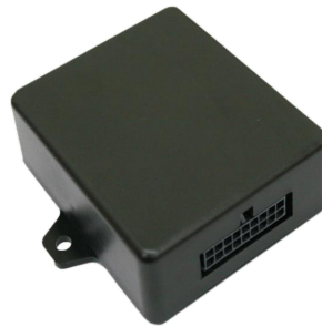
VIM Module NTV-ASY166