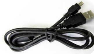
USB Cable NTV-CAB009