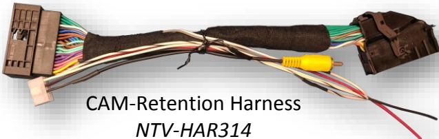
CAM-Retention Harness NTV-HAR314