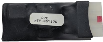
D2C Module NTV-ASY176