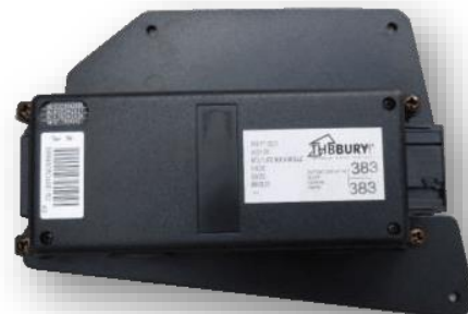
OEM Telephone module

*NOTE: for convertible vehicles, the factory telephone module is located behind the rear seat (vertical).