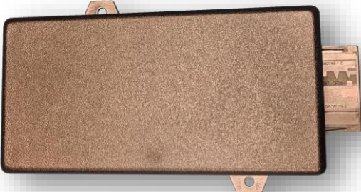
TOOKI-Bentley Module NTV-ASY216