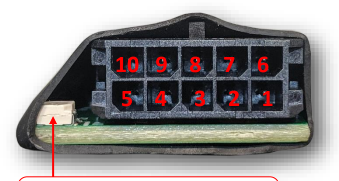
LED: emits green when cargo cam is being switched ON (activated)

Agreement: End user agrees to use this product in compliance with all State and Federal laws. NAV-TV Corp. would not be held liable for misuse of its product. If you do not agree, please discontinue use immediately and return product to place of purchase. This product is intended for off-road use and passenger entertainment only.