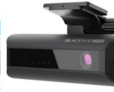
Model no.: DMC200