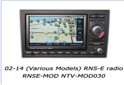
02-14 (Various Models) RNS-E radio RNSE-MOD NTV-MOD030